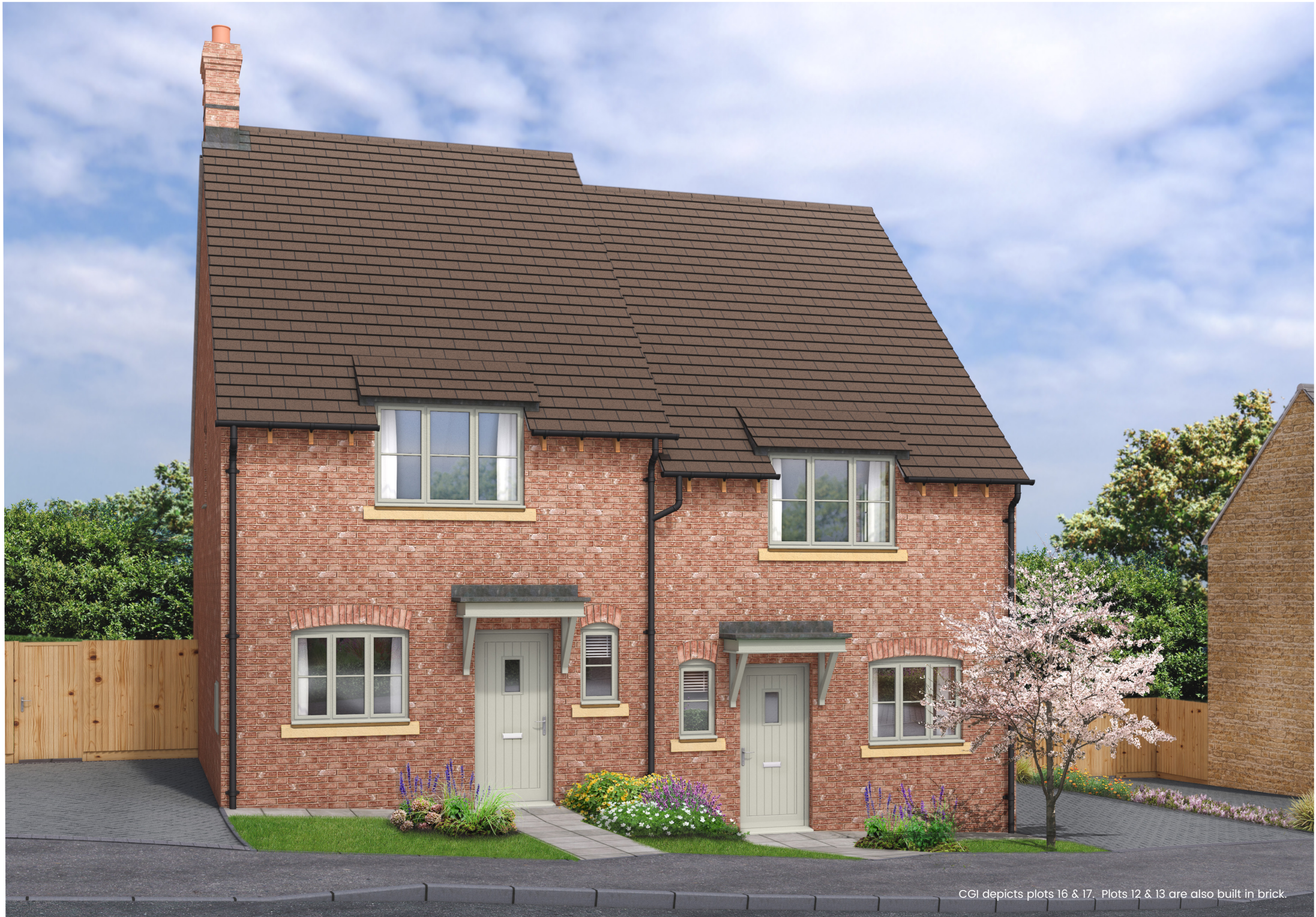
CGI depicts plots 16 & 17. Plots 12 & 13 are also built in brick.