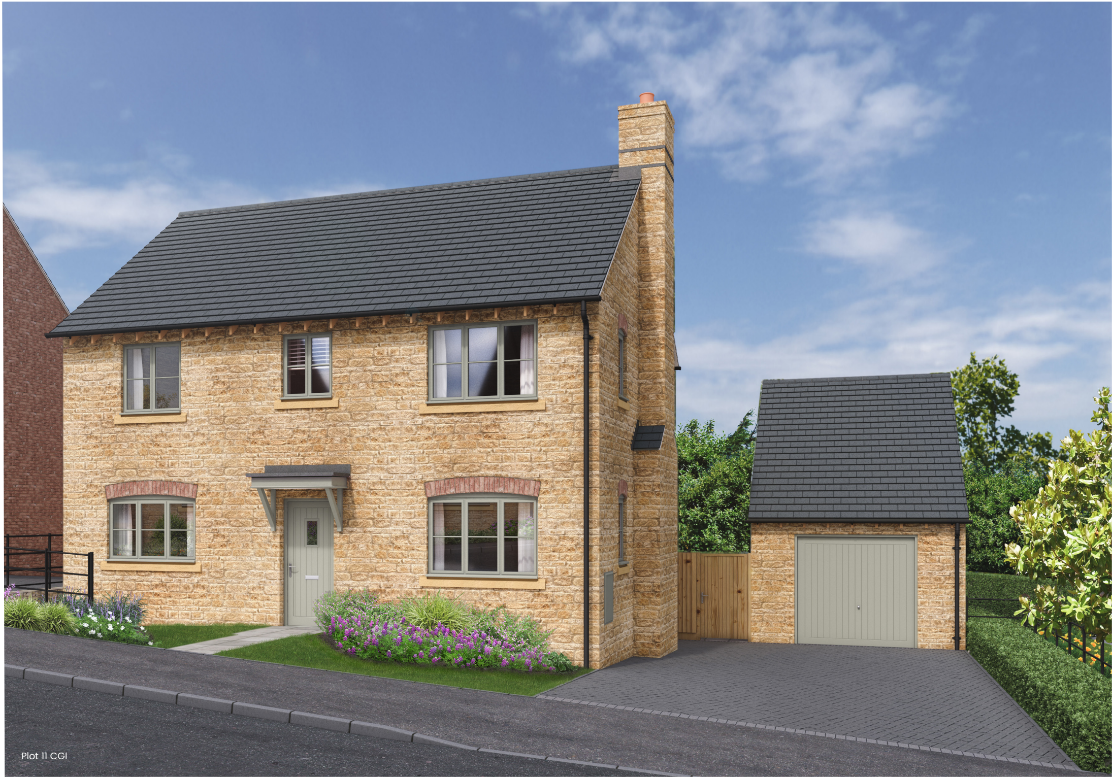
Plot 11 CGI